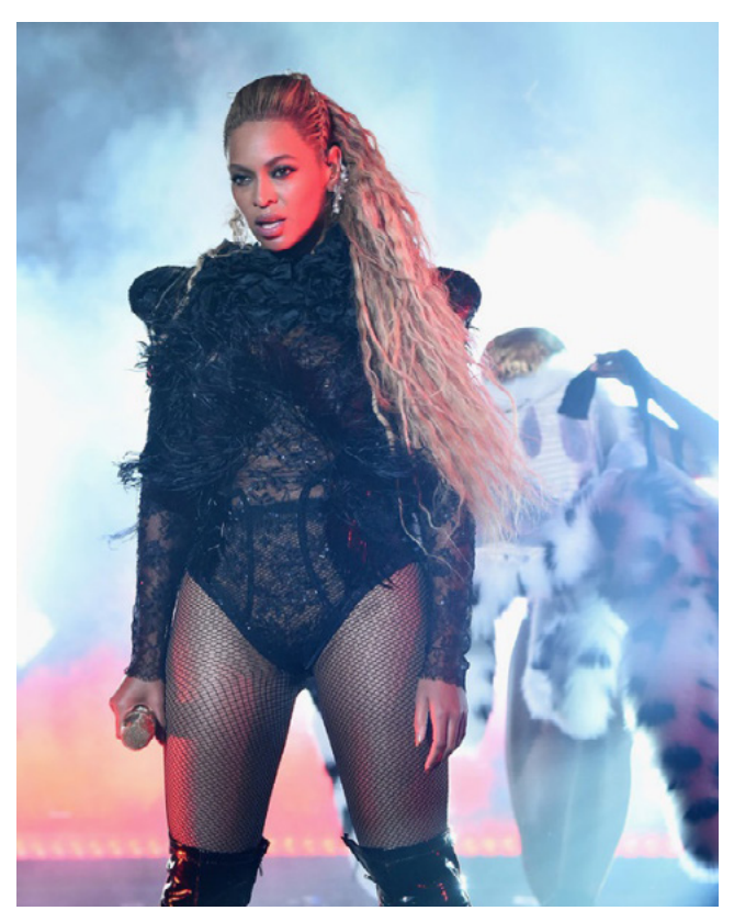
Beyoncé is much more than a historical controlling image. Instead, she creates a narrative rooted in the complexification of Black women.

periences emotions of anger, sadness, triumph, defeat, anything and everything that makes her and other Black women human beings. Through exposure of these emotions, artists like Beyoncé humanize Black women. However, they do not dismiss the status the Black female has had to endure throughout history.