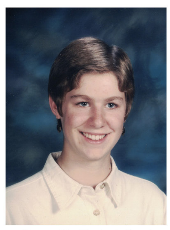
Me, age 15, at the beginning of sophomore year.

"As a doctrinal principle, based on the scriptures, the Church affirms that marriage between a