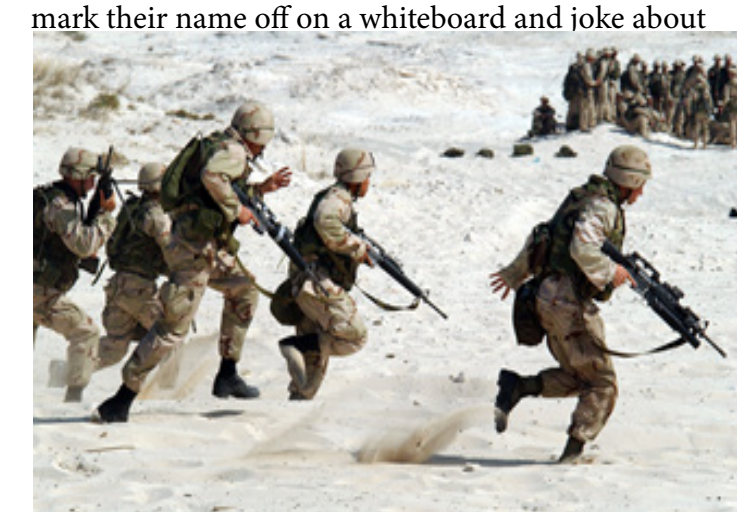
"I don't want to hurt anyone anymore," she said quietly.

think of the mental health of the soldier sitting across from me. I sat there as her words lingered in the air. It made sense, to a point. We worked directly with key decision-makers, and upon our recommendation, the boys in the sky would make it rain death and destruction. Since we had started our mission, we had probably killed hundreds of targets. We would even stream the feed on a big screen, and all watch it like it was the Super Bowl. Once the target was down, we would