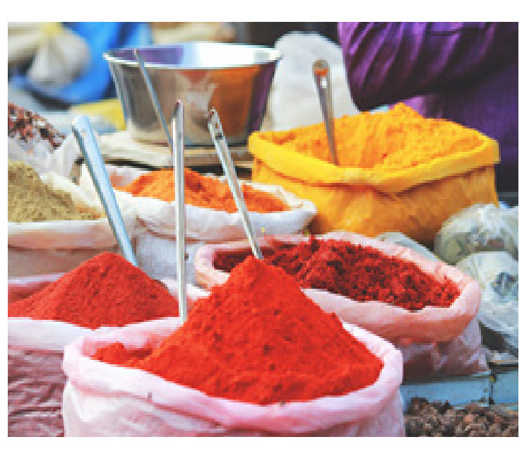
"Indian foods evoke nostalgia..."

identities. Thus, key themes and ideas that emerge from these articles reflect integral parts of how Indian Americans represent their identity to themselves.