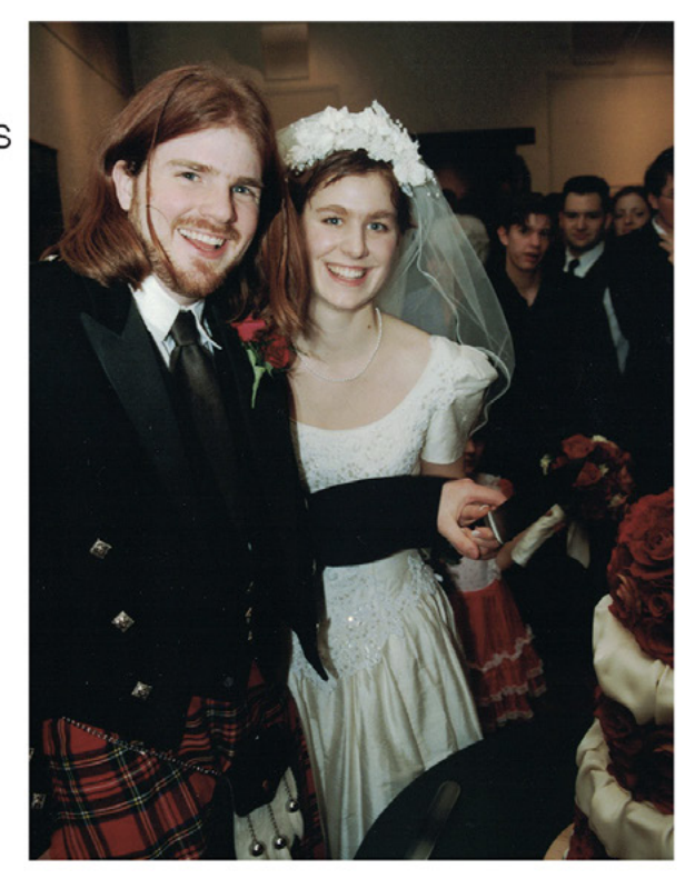
Our wedding was a heck of a party.