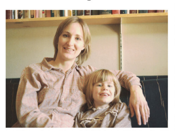
Me and my mom. I think I was five and she was probably thirty-three here.

My mother's eloquent reflection complicates and deepens my understanding of her as a human and as my parent. Though I'd understood the conversation we'd had when I was fifteen through a basic lens of LDS doctrine, I can see