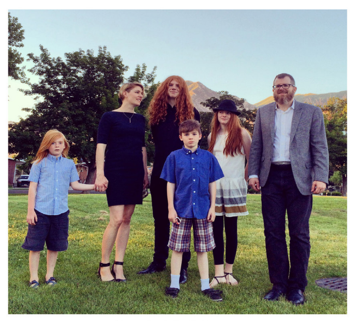
The writer's family in 2015.

To quote Popeye and paraphrase the Old Testament Jehovah, I yam what I yam.