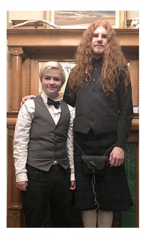
My son, at right, with his boyfriend, after attending Salt Lake Queer Prom 2017.

"Was it hard to admit to yourself that you were bi?" I asked him.