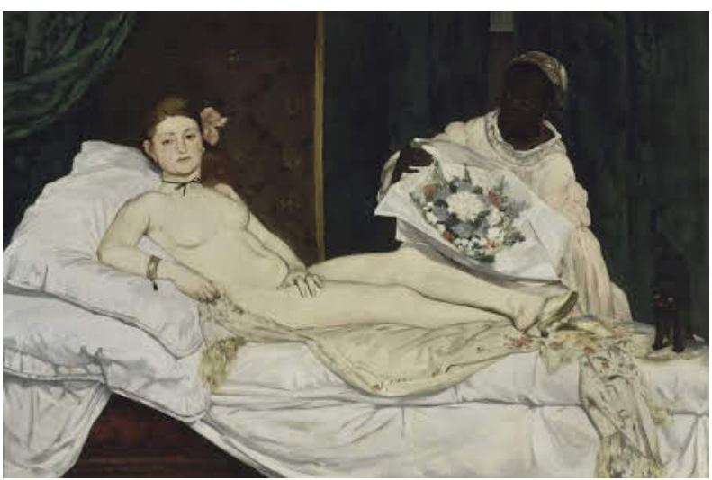
Figure 6. Manet's Olympia c. 1863

argued to be exemplifying the Jezebel image. However, the fundamental difference between the performances of Black female artists like Beyoncè and the sexual images cast on their ancestors is who controls their sexuality. "You, the viewer, are consuming her as a commodity but you are consuming her in the exact manner that she wants you to worship her, buy her songs, and attend her concerts." (Trier-Bieniek 58). A controlling image is a definition placed on an inferi-