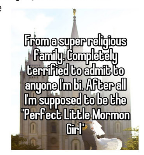
Recent whisp.r post.

While the internet barely existed when I was a teenager in the nineties, today a quick Google search of the terms "Mormon bisexual" reveals all kinds of things, including whisp.r posts from LDS kids about being bi and scared to tell anyone. At the very least, bisexual LDS youth in Utah can talk about it now – they know it's a thing.